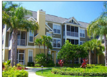
TGM Bay Isle

City: St. Petersburg Buyer: TGM Associates Purchase Price: $94 MM Price per Unit: $167,112