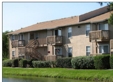
Trellis at the Lakes

City: St. Petersburg Buyer: ESG Kullen Purchase Price: $81 MM Price per Unit: $117,515