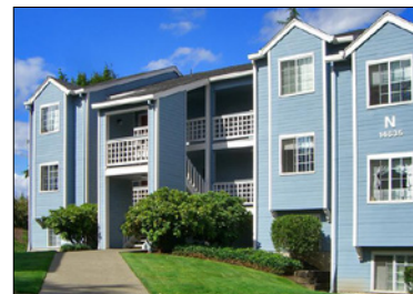
Seven West at the Trails

City: Beaverton, Ore. Buyer: LaSalle Investment Management Purchase Price: $96 MM Price per Unit: $226,950