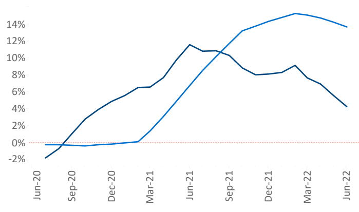
Absorbed Completions T12