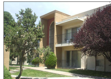
Avaria of Santa Fe

City: Santa Fe Buyer: Virtu Investments Purchase Price: $18 MM Price per Unit: $107,103